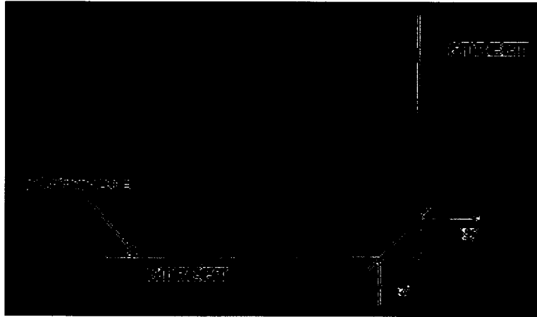
(OLD GRAPHIC ABOVE TO BE REPLACED WITH NEW GRAPHIC BELOW)